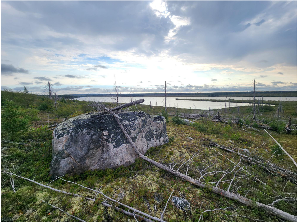
Figure 2. Pegmatite boulder mapped at Bugatti Lithium Property.